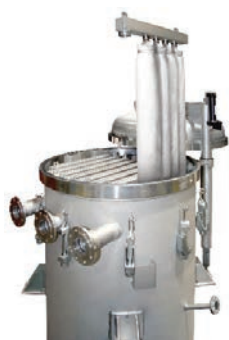
The Cricketfilter® Automated System