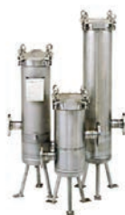
Cartridge Filter Housings