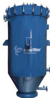
The Versis® Pressure Filter Leaf System